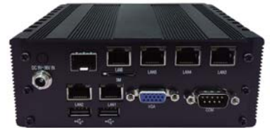
2I386EW / 2I385EW + L2L002 Back Panel