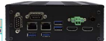
2I392CW Back Panel