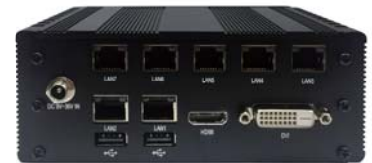
2I390CW + L2L001 Back Panel