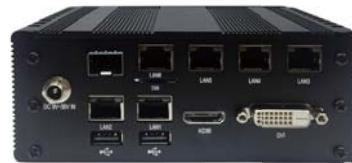
2I390CW + L2L002 Back Panel