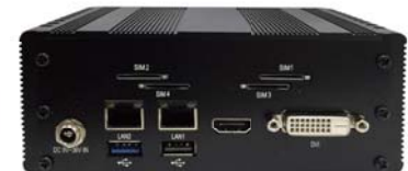
2I390CW + L2M001 Back Panel

M/B information: ( Please refer to M/B specification )