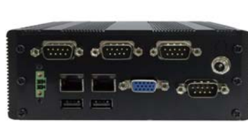
2I386EW / 2I385EW / 2I385CW Back Panel