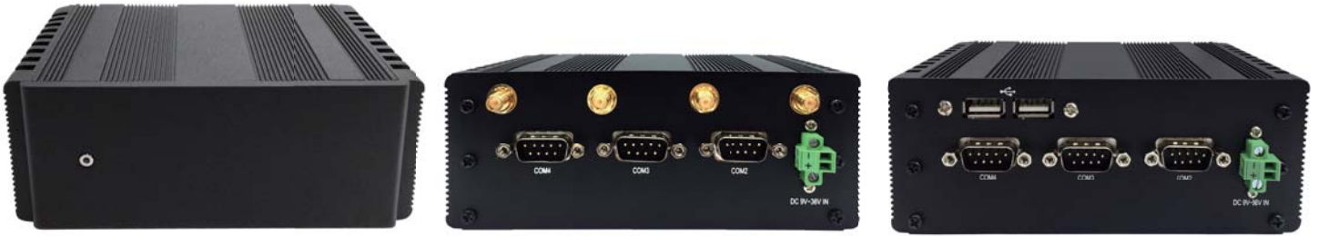
2I386EW / 2I385EW + L2M001 Front Panel (OEM)