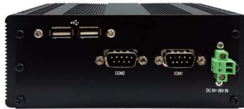
2I392CW + L2L001 Front Panel (OEM)