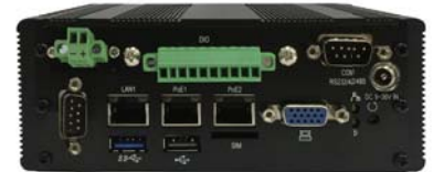
2I380NX Back Panel

M/B information: ( Please refer to M/B specification )