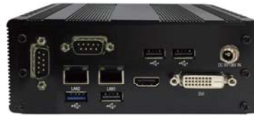
2I390CW Back Panel