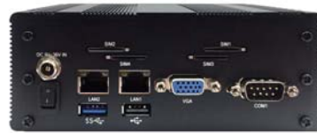
2I386EW / 2I385EW + L2M001 Back Panel