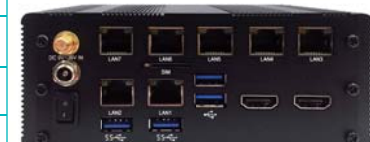
2I392CW + L2L001 Back Panel