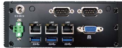
2I610DW Back Panel

M/B information: ( Please refer to M/B specification )